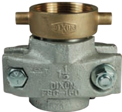
female Flat Seal NPSM