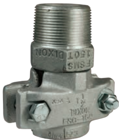
male Flat Seal NPT