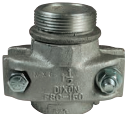
male Flat Seal NPSM