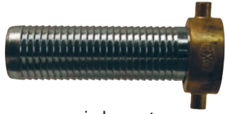
pin lug nut