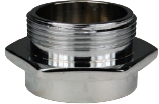
polished chrome plated